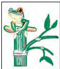
.gif @ 400%

Files obtained from the Internet (.jpg or .gif) or artwork created in MS Office applications (Word, PowerPoint, Publisher, Excel, etc.) are not suitable for high quality output, and require additional hourly charges. Artwork should be created in a design program at 50-100% of actual size. If you have very large files please contact us for options. To avoid additional costs, please send files using the guidelines below.