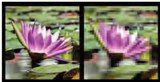
High Resolution (300 dpi)

* All fonts within the artwork need to be converted to outlines.