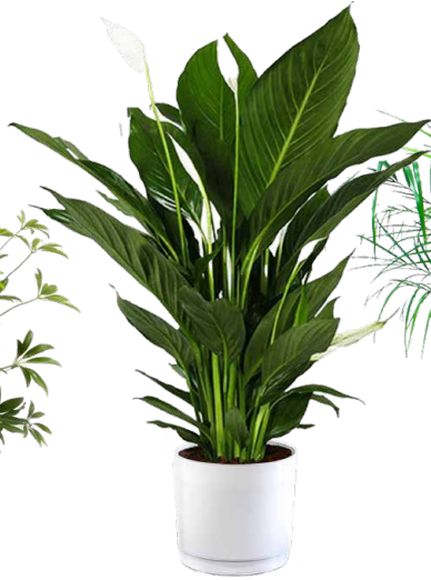
2 - 3' Spath