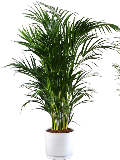
4 - 6' Areca Palm