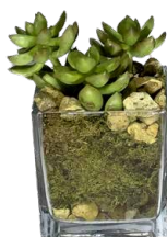
F2 6" tall x 4" wide $45.00 each