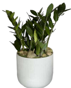
H 10-14" tall x 5-6" wide $65.00 each