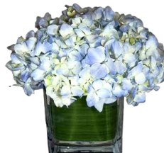
G2 6" tall x 5" wide $50.00 each