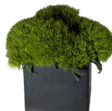
E 6" tall x 5" wide $65.00 each