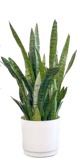
2 - 3' Snake Plant