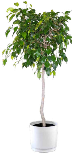
5 - 6' Ficus Tree