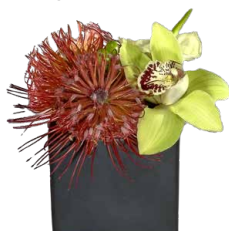
D 6" tall x 5" wide $65.00 each