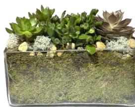
I2 7" tall x 7-8" wide $85.00 each