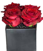
C 6" tall x 5" wide $60.00 each