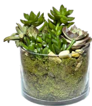
I1 7" tall x 5-6" wide $85.00 each