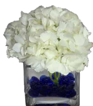
G1 6" tall x 5" wide $50.00 each