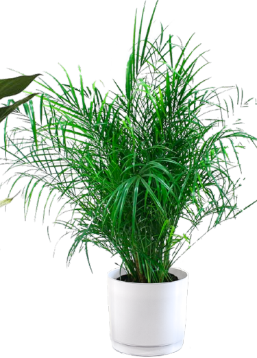
2 - 3' Palm