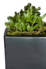
F1 6" tall x 4" wide $45.00 each