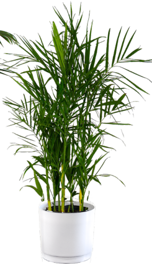
4 - 6' Bamboo Palm