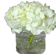
G3 6" tall x 5" wide $50.00 each