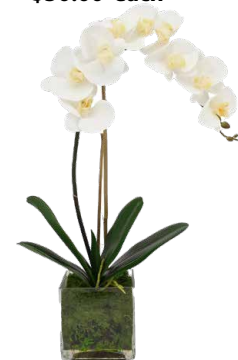
J 16-18" tall x 10" wide $95.00 each

Please note seasonal adjustments may apply to the above arrangements. Customized floral arrangements are also available for your Booth, Hospitality Suite, Off-site Functions and Banquets. Please reach out to our design team to get a quote!