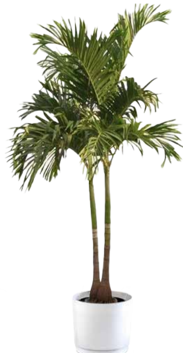
8 - 10' Andonidia Palm

*Discount pricing only applies to orders received and paid in full thirty days prior to Exhibitor Move In